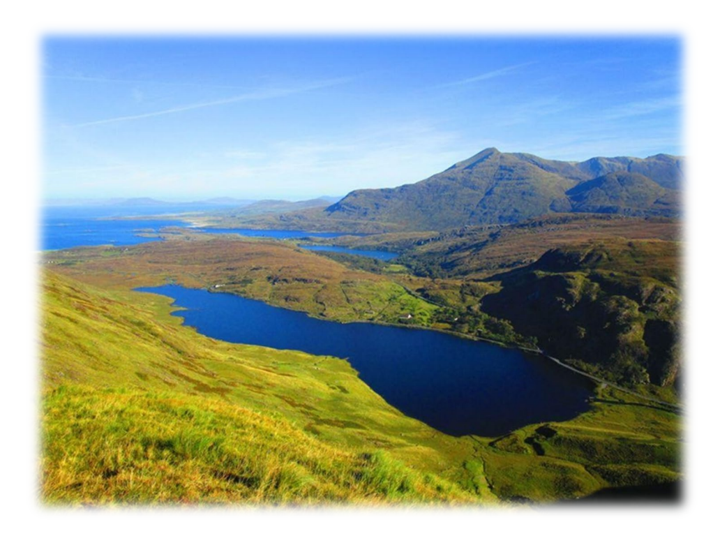
Project 3: Bi-lingual Geological Heritage Workbook for Junior Certificate (including videos and podcasts)

The aim of the project is to create a greater awareness, knowledge and understanding of the richness of the geological heritage resources of County Galway for teachers and students.